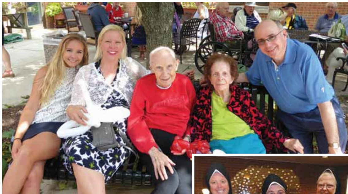
See more photos on pg. 6.