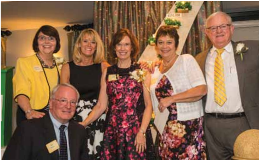
2017 GOLD KEY COMMITTEE

We've been blessed to co-sponsor the Gold Key Gala with The Guild of St. Patrick's for 14 years. The proceeds from the Gold Key Gala play a critical role in allowing St. Patrick's Residence to enhance our services and make facility improvements.