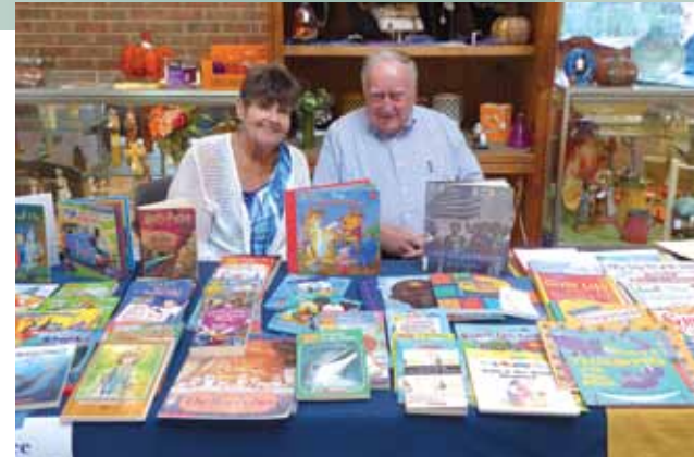
Grandchildren and great-grandchildren attending the Grandparent's Day Celebration enjoyed Let's Read Books too!